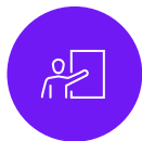
Live scientific meetings