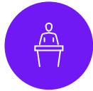
Thought leader engagement