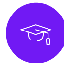
Training (internal and external)